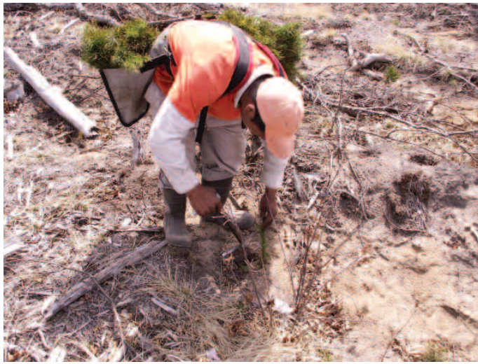
Thousands of jack pine seedlings are planted annually in the northeast Lower Peninsula.

Kirtland's warblers spend eight months wintering in the Bahamas. The males arrive back in Michigan between May 3 and May 20, a few days ahead of the females. The males es-