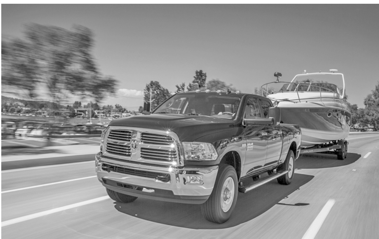
The all-new 2015 Jeep Renegade makes its debut on the 10 Coolest New Cars Under $18,000 list.