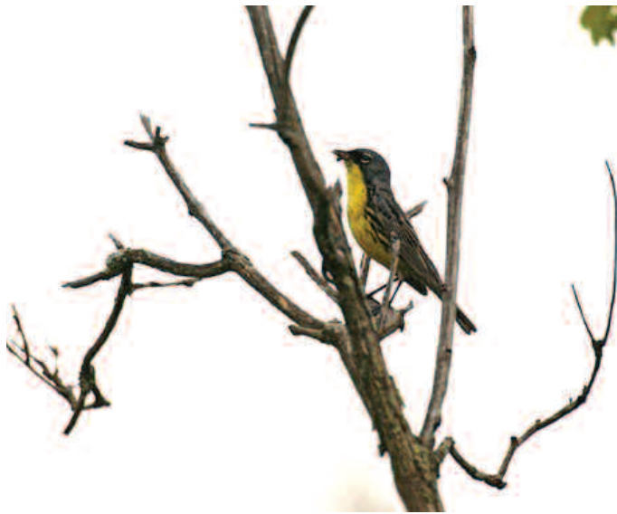
A male Kirtland's warbler perches in a tree in northeast Michigan.

establish and defend territories and then court the females when they arrive. The males' song is loud, yet low-pitched, ending with